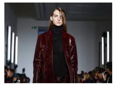
WOMEN, FASHION, COLLECTIONS, RUNWAY