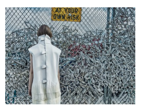
WOMEN, MEN, FASHION