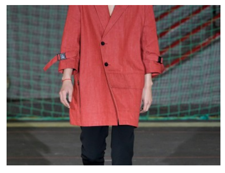
MEN, FASHION, RUNWAY